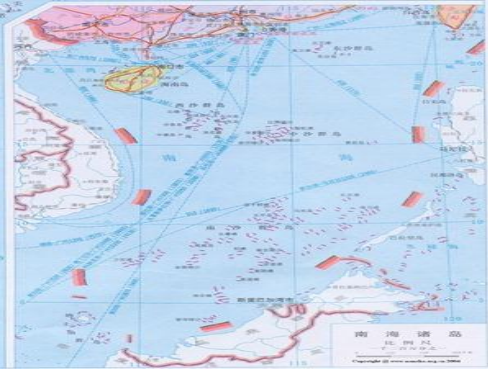
南海诸岛 比例尺